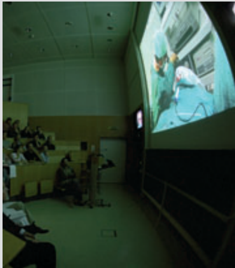
Education at the Medical University of Graz: practice-oriented education, small study groups, use of new media

The Medical University of Graz is a young university with a long-standing tradition: As early as 1863 much emphasis was laid on medical research